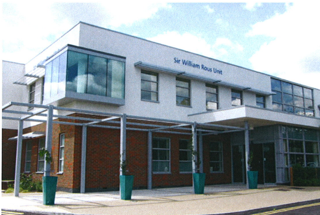
The New Sir William Rous Unit at Kingston Hospital